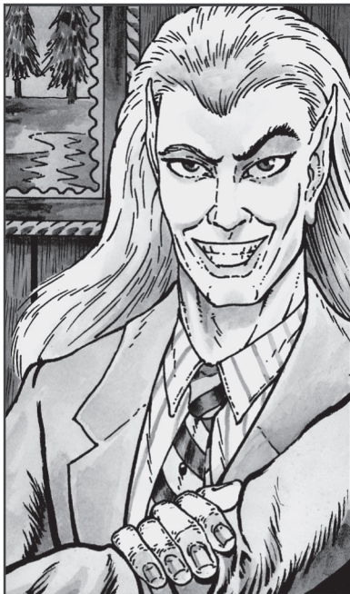
ZASTER "FORESTER" STILLSTAR