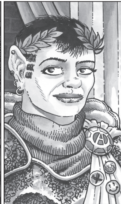
SHALEA "SUNBURN" STEELWAGON

This printing of Dungeonbattle Brooklyn is done under version 1.0 of the Open Gaming License, and the System Reference Document by permission from Wizards of the Coast, Inc. Designation of Product Identity: The following items are hereby designated as Product Identity in accordance with Section 1(e) of the Open Game License, version 1.0: Dungeon Crawl Classics, DCC RPG, Mighty Deed of Arms, spell check, Luck check, spellburn, mercurial magic, corruption, disapproval, all spell names, all proper nouns, capitalized terms, italicized terms, artwork, maps, symbols, depictions, and illustrations, except such elements that already appear in the System Reference Document.